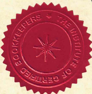
Chief Executive Officer